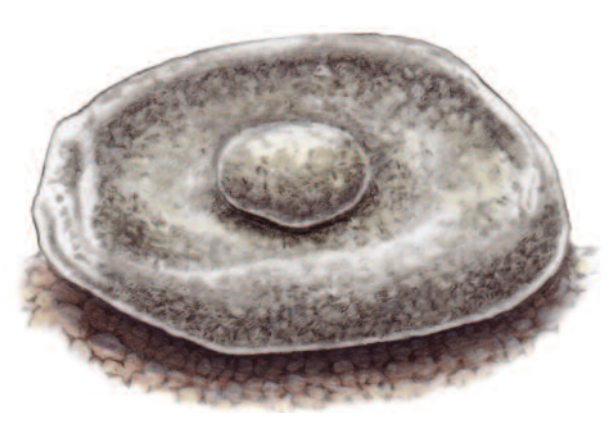
Seeds, grains, and grasses were ground on a grinding stone with a hand stone.

Archaic-period hunters seem to have stayed longer in each place. They returned year after year to the same seasonal camps. Archaeologists think this because they find many more campsites. The longer people use a place, the more they leave behind. Some camps have small houses that were used the same season every year. Fire pits and cooking areas were also used over and over. Very important, heavy, and hard-to-carry artifacts like grinding stones were left at camps. Some camps even had places where food was kept for future visits. There are other clues that make archaeologists think that people stayed in smaller territories. The people