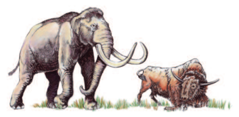
Mammoths and giant bison lived here 12,000 years ago.

Twelve thousand (12,000) years ago, it was cooler and wetter than it is today. Some different animals and plants lived at this time. Paleoindian people took advantage of everything around them. They were successful hunters of very big game animals. Imagine hunting animals the size of elephants with sticks and stones! Some of the largest animals hunted were mammoths and giant bison. All of the big game animals are now extinct. Hunters also trapped smaller animals like rabbits, birds, and lizards. Fruit, nuts, seeds, leafy greens, and roots were a of their diet.