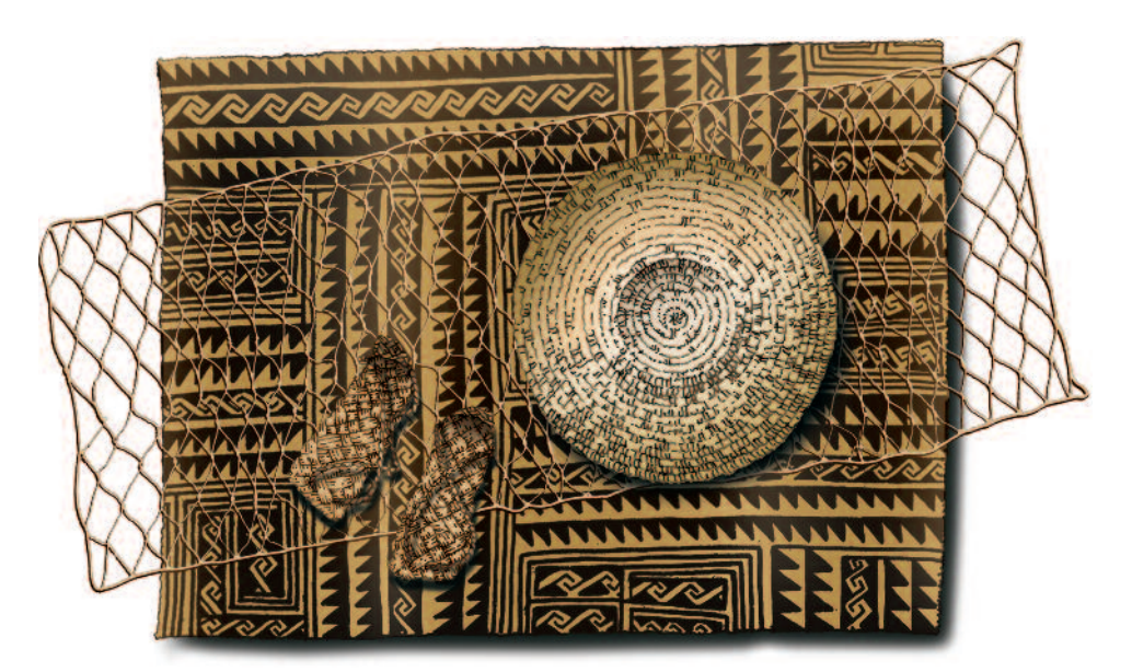
Sandals and a basket sit on a woven net and a piece of painted cotton cloth.

The Archaic-period people were very successful hunters and gatherers. Like all hunting and gathering people, they carried most of their things. Like past people, they created tools and weapons out of wood, bone, stone, and plant material. In Arizona, there are lots of types of stone hunting tools made by Archaic-period peoples. They also made baskets, sandals, nets, blankets, and bags. They built the frame of their shelters with sticks. The frame was covered with animal hides or woven mats. People made tools and jewelry out of bone, stone, shell, and wood. Except for stone, all of these materials usually rot. But some have been found by archaeologists in very dry places.